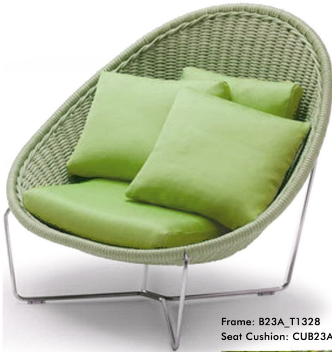
Frame: B23A_T1328 Seat Cushion: CUB23AE_BT051937